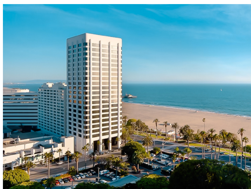
100 Wilshire Exterior

JLL announced today that Raven Capital , an alternative investment firm specializing in asset-based, non-sponsor private credit, has signed a new 12,251-square-foot office lease at 100 Wilshire, a 21-story, 252,536-square-foot Class A office building located at 100 Wilshire Boulevard in Santa Monica, California. The firm is relocating from 7,256 square feet at 1335 4th Street in Santa Monica. The new space will serve as the West Coast headquarters for Raven’s expanding team and investment platform, reflecting the firm’s increasing scale, momentum and long-term commitment to the Los Angeles market.